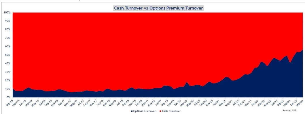
Exhibit 06 : NSE Cash vs Options Premium Turnover

.....Valuations remains subdued across top 10 pharma players, making attractive for bets.