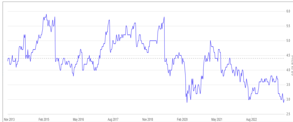
Exhibit 04 : HDFC Bank PBV(x) trading at stiff discount to 10Yr Median.